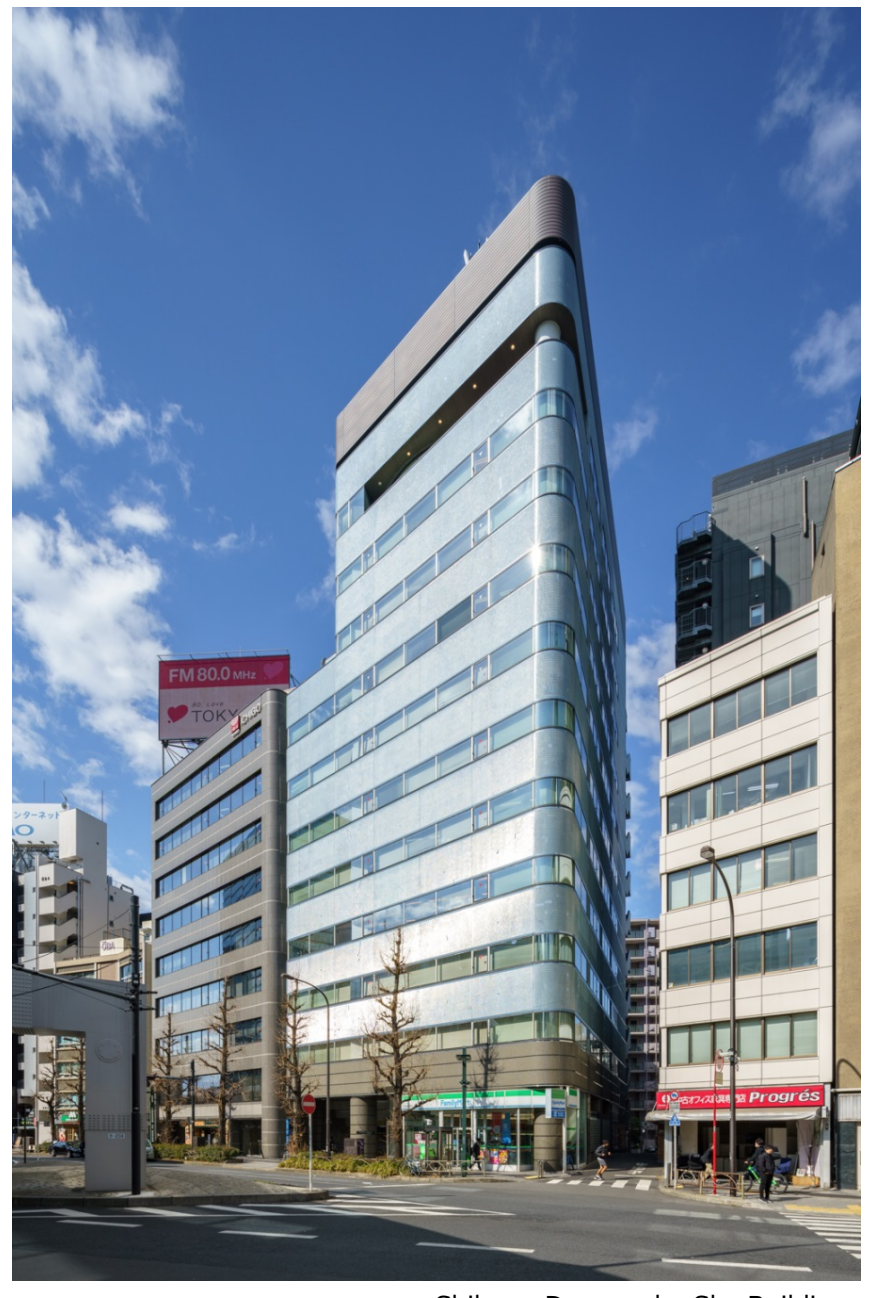
Shibuya Dogenzaka Sky Building