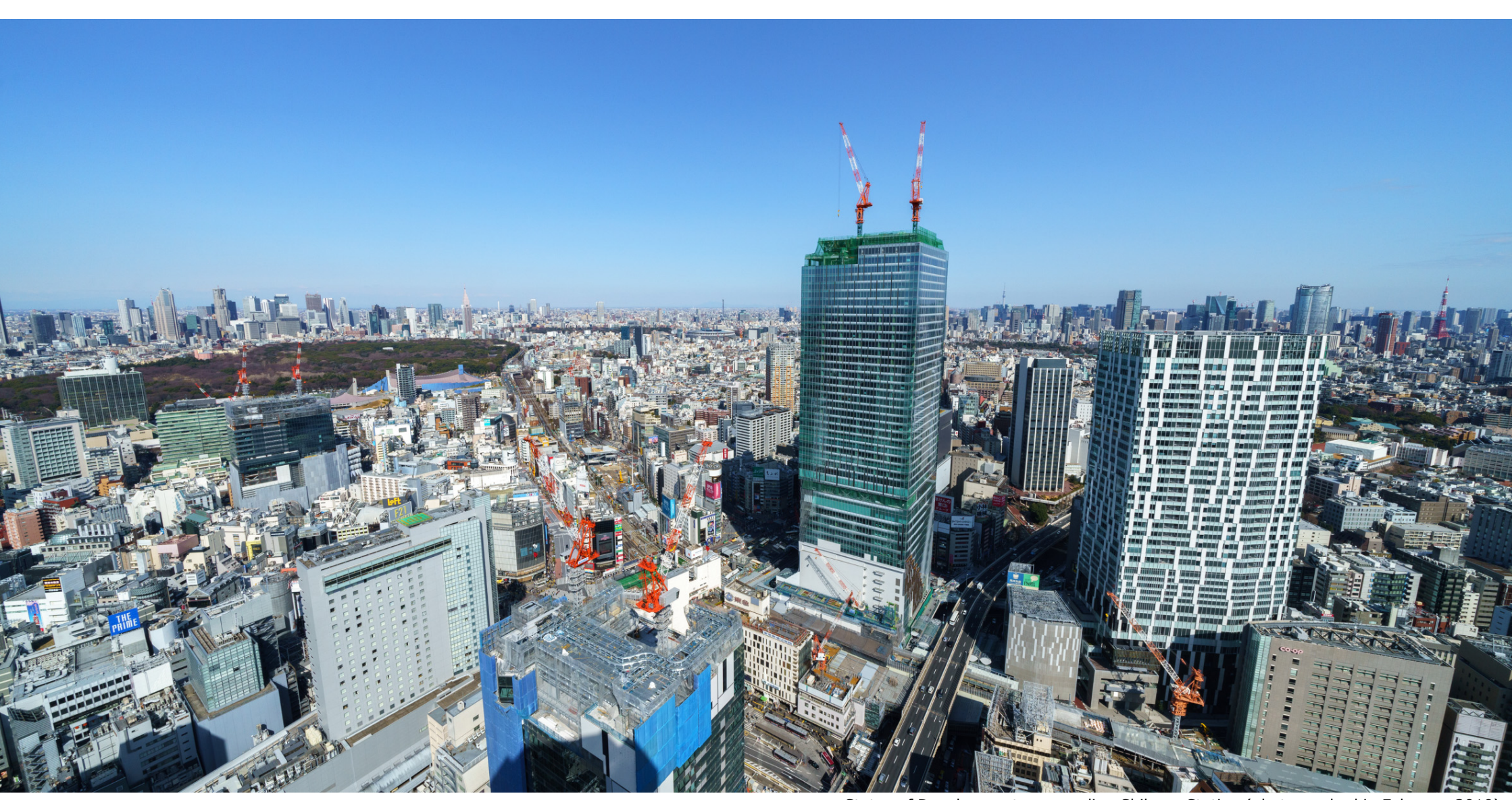
Status of Development surrounding Shibuya Station (photographed in February 2019)